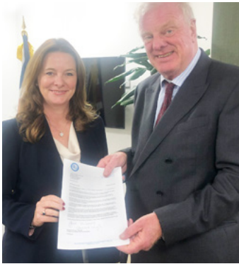
Sir Edward Leigh presents the Catholic Union's open letter to Education Secretary Gillian Keegan

Our open letter to the Education Secretary received a terrific response from Catholics across England, including teachers, parliamentarians, and Bishops. Having demonstrated the strength of feeling about this policy, we hope the Government will listen.