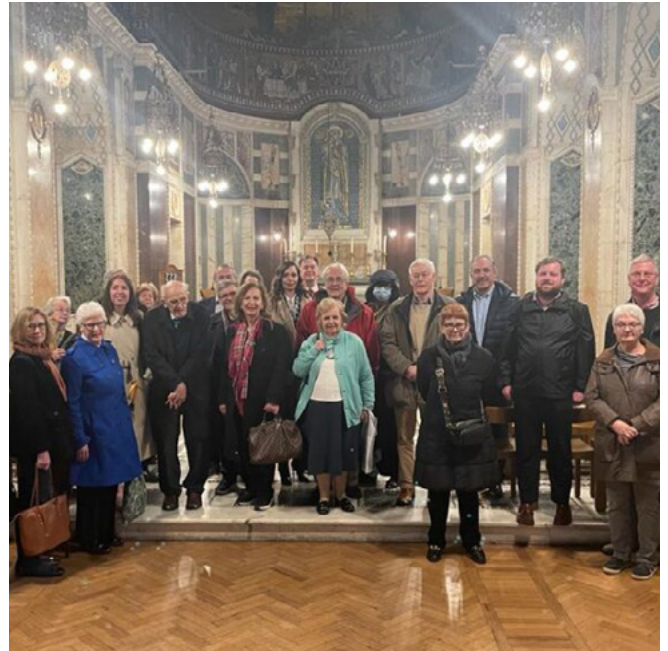
Westminster Cathedral visit