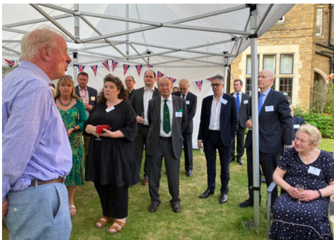
Sir Edward Leigh speaking to Supporters of the St Thomas More Circle

On 15 June this year, close to his Feast Day, we welcomed Supporters and Benefactors of our St Thomas More Circle and other guests to Mass and a Reception at St Mary's Cadogan Street, close to the former home of St Thomas More in Chelsea.