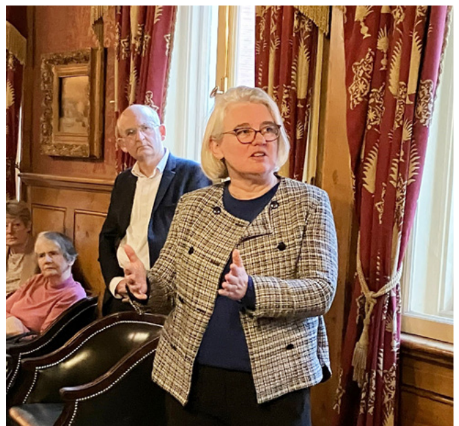
Rt Hon Ruth Kelly speaking at a Pub Talk

In January we launched a new series of Pub Talks which have taken place at the Windsor Castle pub (formerly known as The Cardinal ) behind Westminster Cathedral. These talks give people the opportunity to meet and hear from a Catholic figure in public life. We have so far had excellent talks from Lord Alton, Ruth Kelly, Ann Widdecombe, and Catherine McKinnell MP.