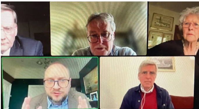
Assisted Dying Webinar