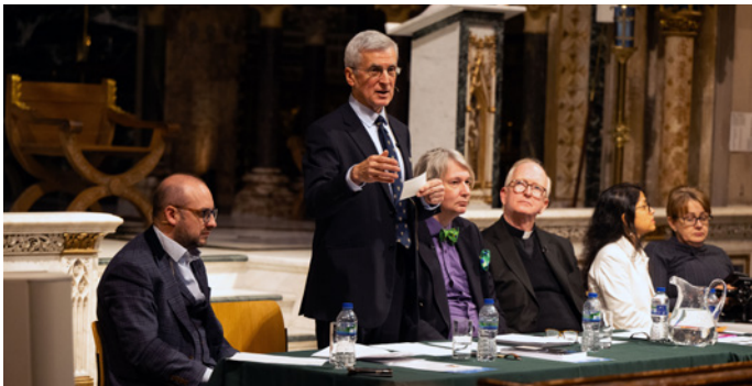
Assisted Dying Panel Discussion