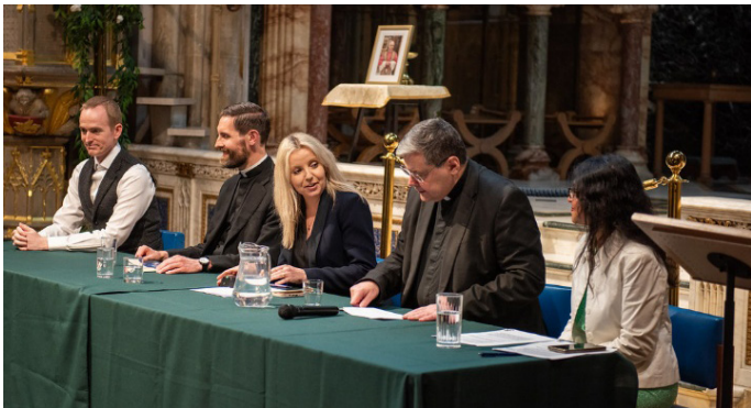
AI Faith and Ethics at a Crossroads